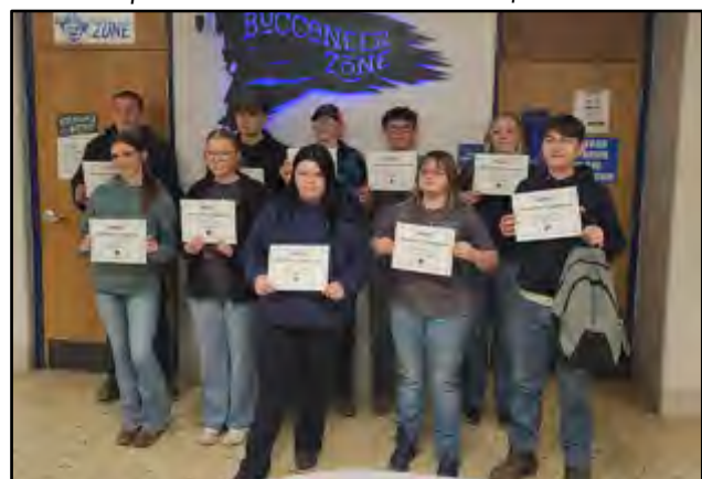
Students received certificates for completing the course.