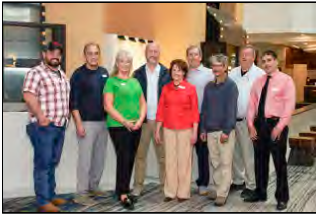
Board members and officers attending the symposium