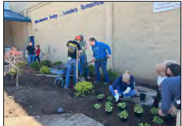
Students dig into installation.

We commend and thank these members for their commitment to investing in the next generation and helping ensure a strong, skilled workforce for years to come.