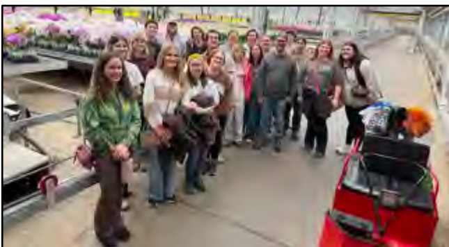
Students enrolled in a Greenhouse Management course at WVU visit Green Circle Growers' greenhouses in Oberlin, Ohio.

Looking ahead, we are excited to once again offer a study abroad experience in western Europe this summer—an opportunity made possible through your continued support. We are also preparing for the upcoming academic year, including recruiting students for the National