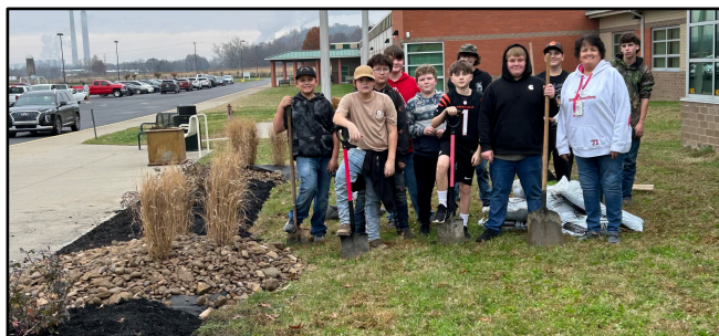
Students survey the landscaping they worked hard to create.