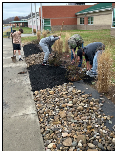
Students in the Discover Your Future class work to install the newly landscaped entrance to their school.