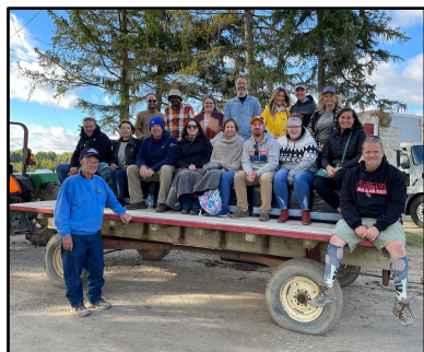
WVNLA members enjoy outings such as a tour of northern Ohio nurseries several years ago.

Your window to earn monetary prizes for attracting new members is closing soon. You have until December 31 to snag $750, $500, or $250. Those prizes will go to the top three current WVNLA members who recruit new members. This is a great opportunity to grow our community of