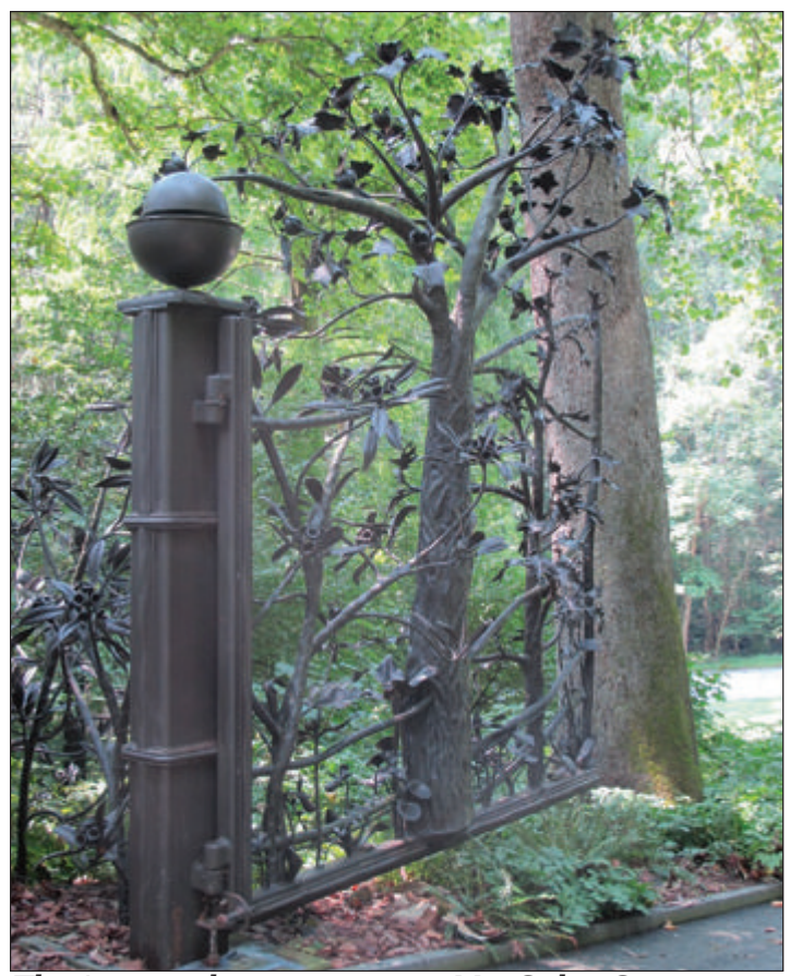
The ironwork entry gate to Mt. Cuba Center

Please note accompanying photos to the left and right.