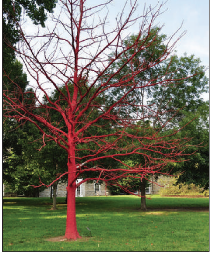
A dramatic dead tree painted red on the grounds of Scott Arboretum, Swarthmore College

Baltimore Convention Center Baltimore, MD Show Hours: January 11 & 12 (9:00 am - 5:00 pm) January 13 (9:00 am - 2:00 pm)