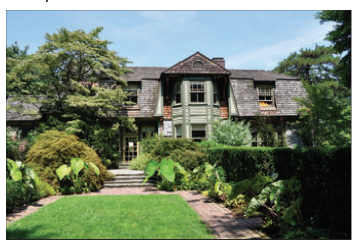
Offices of the Scott Arboretum