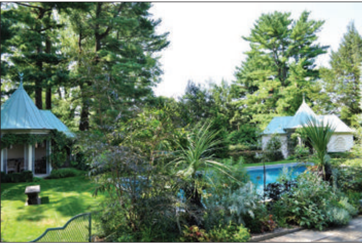
Twin pool cabanas at Chanticleer Garden